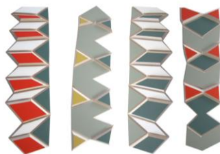
Totems, Clare Willard, 2010